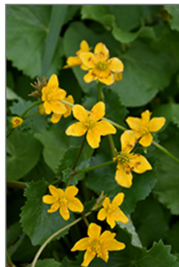
Marsh Marigold flowers