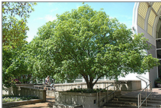
Purpleblow Maple