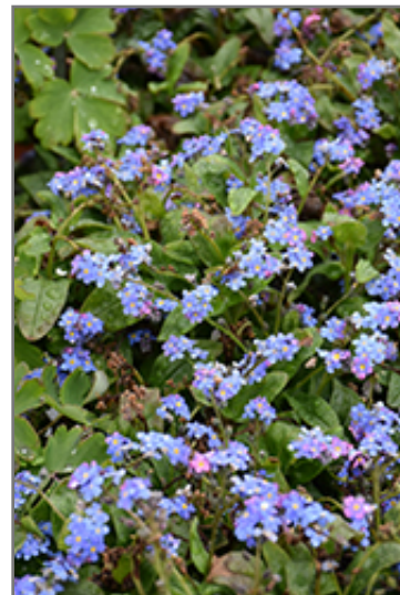
Victoria Blue Forget-Me-Not flowers

Victoria Blue Forget-Me-Not is recommended for the following landscape applications;