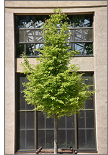
Persian Parrotia