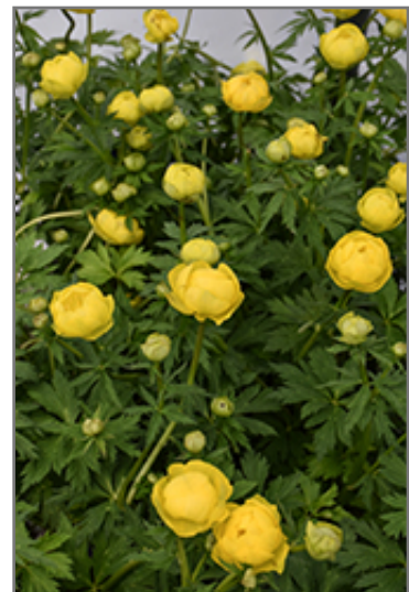
Lemon Queen Globeflower flowers