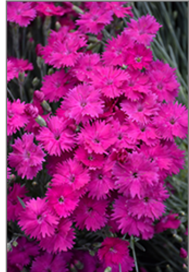
Neon Star Pinks flowers

This is a relatively low maintenance plant, and is best cleaned up in early spring before it resumes active growth for the season. It is a good choice for attracting bees and butterflies to your yard, but is not particularly attractive to deer who tend to leave it alone in favor of tastier treats. It has no significant negative characteristics.