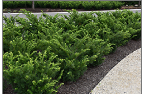
Densiformis Yew