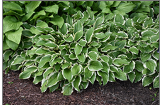
So Sweet Hosta

This is a relatively low maintenance plant, and is best cleaned up in early spring before it resumes active growth for the season. Gardeners should be aware of the following characteristic(s) that may warrant special consideration;