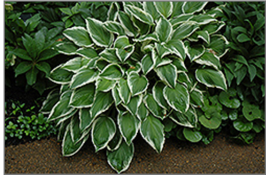
So Sweet Hosta

This plant does best in partial shade to shade. It prefers to grow in average to moist conditions, and shouldn't be allowed to dry out. It is not particular as to soil type or pH. It is somewhat tolerant of urban pollution. This particular variety is an interspecific hybrid. It can be propagated by division; however, as a cultivated variety, be aware that it may be subject to certain restrictions or prohibitions on propagation.