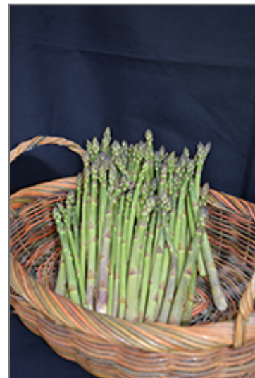
Jersey Knight Asparagus fruit

This plant is typically grown in a designated vegetable garden. It does best in full sun to partial shade. It does best in average to evenly moist conditions, but will not tolerate standing water. It is not particular as to soil pH, but grows best in rich soils. It is somewhat tolerant of urban pollution. This particular variety is an interspecific hybrid.