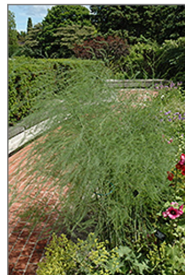
Jersey Knight Asparagus