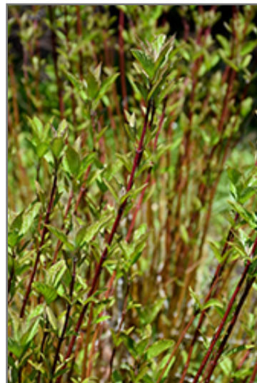
Arctic Fire Red Twig Dogwood stems