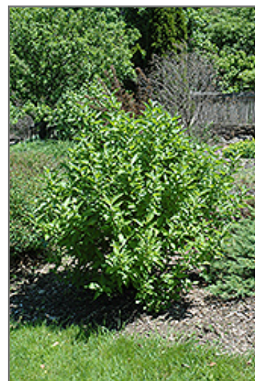
Arctic Fire Red Twig Dogwood