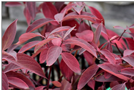
Arctic Fire Red Twig Dogwood in fall

This shrub does best in full sun to partial shade. It is an amazingly adaptable plant, tolerating both dry conditions and even some standing water. It is not particular as to soil type or pH. It is highly tolerant of urban pollution and will even thrive in inner city environments. This is a selection of a native North American species.