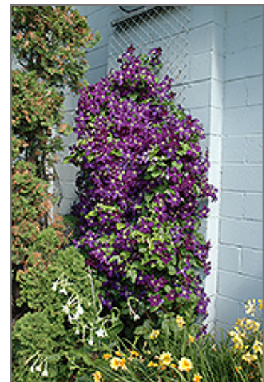
Jackmanii Superba Clematis in bloom