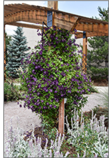
Jackmanii Superba Clematis in bloom

Jackmanii Superba Clematis makes a fine choice for the outdoor landscape, but it is also well-suited for use in outdoor pots and containers. Because of its spreading habit of growth, it is ideally suited for use as a 'spiller' in the 'spiller-thriller-filler' container combination; plant it near the edges where it can spill gracefully over the pot. It is even sizeable enough that it can be grown alone in a suitable container. Note that when grown in a container, it may not perform exactly as indicated on the tag - this is to be expected. Also note that when growing plants in outdoor containers and baskets, they may require more frequent waterings than they would in the yard or garden.