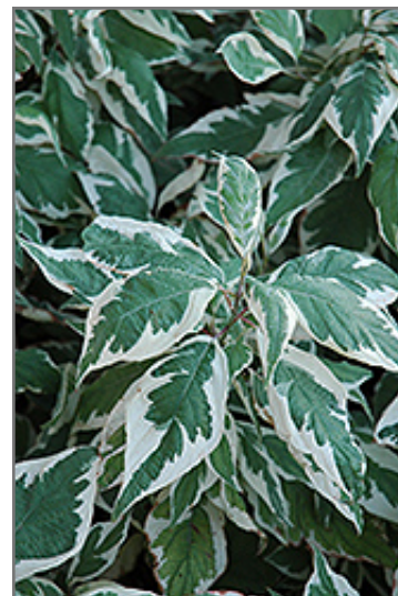
Ivory Halo Dogwood foliage