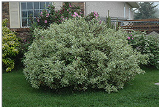
Ivory Halo Dogwood

Ivory Halo Dogwood is recommended for the following landscape applications;