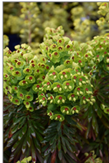
Tiny Tim Spurge flowers

Tiny Tim Spurge is recommended for the following landscape applications;