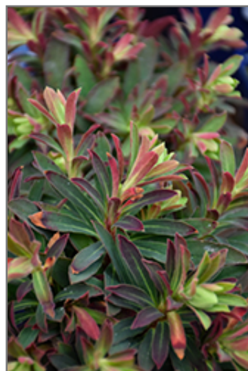
Tiny Tim Spurge flowers