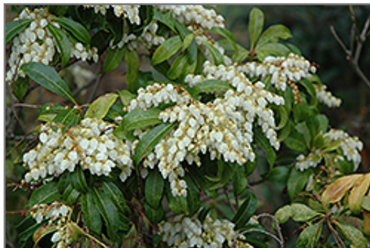
Red Mill Japanese Pieris flowers

Red Mill Japanese Pieris is recommended for the following landscape applications;