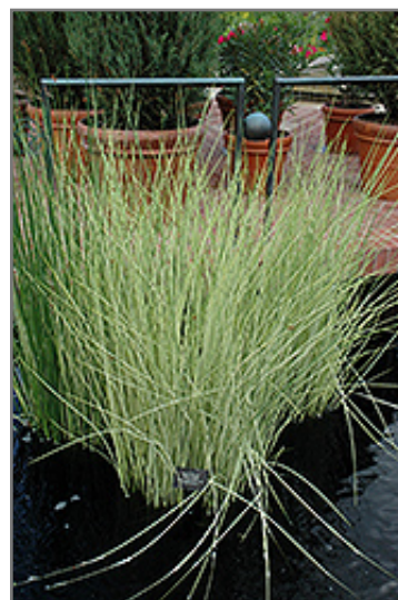
White Rush flowers