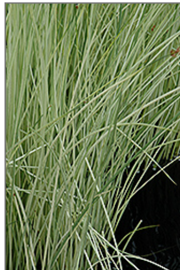
White Rush foliage