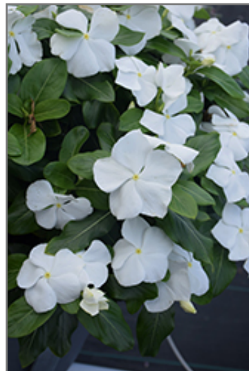
Titan Pure White Vinca flowers

This plant will require occasional maintenance and upkeep, and should not require much pruning, except when necessary, such as to remove dieback. It is a good choice for attracting butterflies to your yard, but is not particularly attractive to deer who tend to leave it alone in favor of tastier treats. It has no significant negative characteristics.