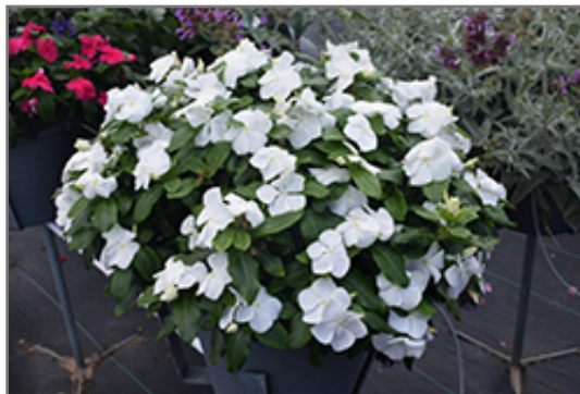
Titan Pure White Vinca in bloom

Titan Pure White Vinca is a fine choice for the garden, but it is also a good selection for planting in outdoor containers and hanging baskets. It is often used as a 'filler' in the 'spiller-thriller-filler' container combination, providing a mass of flowers against which the thriller plants stand out. Note that when growing plants in outdoor containers and baskets, they may require more frequent waterings than they would in the yard or garden.