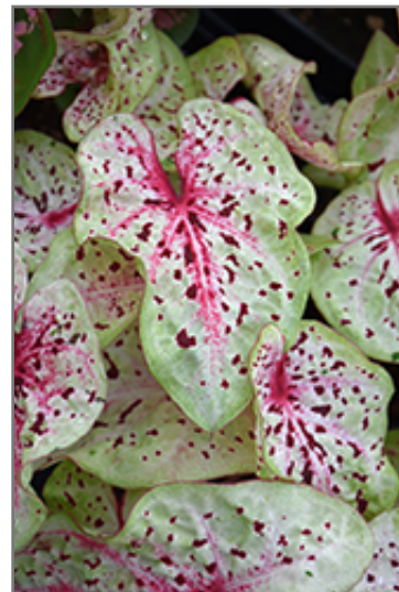
Miss Muffet Caladium foliage

Miss Muffet Caladium is recommended for the following landscape applications;