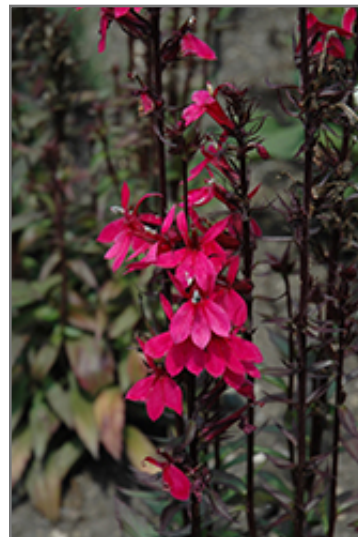
Starship Deep Rose Lobelia flowers

Starship Deep Rose Lobelia is recommended for the following landscape applications;