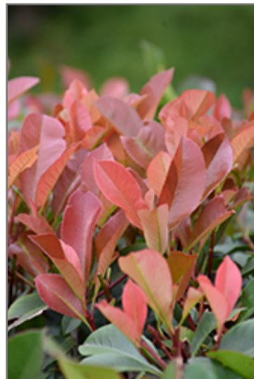
Red Tip Photinia foliage