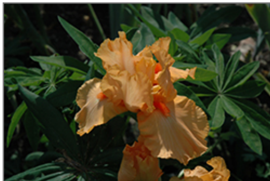
Orange Harvest Iris flowers