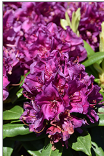
Polarnacht Rhododendron flowers