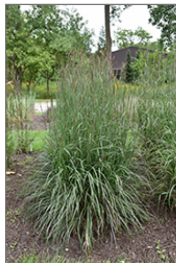
Blackhawks Bluestem in bloom