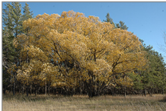
White Willow in fall

White Willow is recommended for the following landscape applications;