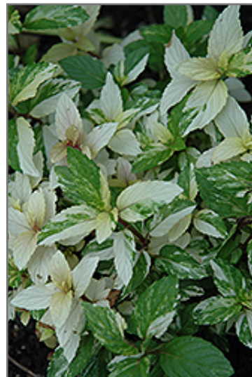
Variegated Peppermint foliage

This is an herbaceous perennial herb with a spreading, ground-hugging habit of growth. Its medium texture blends into the garden, but can always be balanced by a couple of finer or coarser plants for an effective composition. This is a high maintenance plant that will require regular care and upkeep, and should be cut back in late fall in preparation for winter. It is a good choice for attracting butterflies to your yard. Gardeners should be aware of the following characteristic(s) that may warrant special consideration;